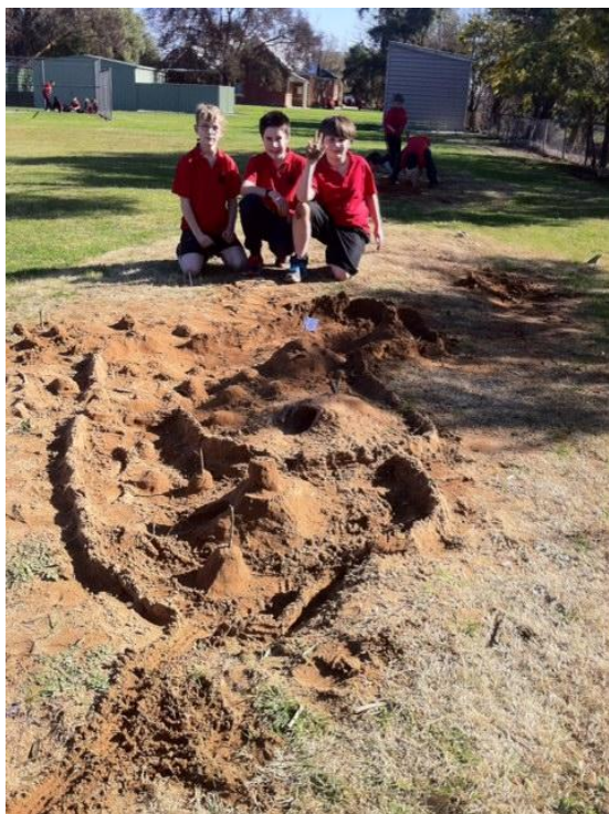
This week as part of the Numeracy programme, the children built sandcastles.

Look out for some photos in next week's newsletter.